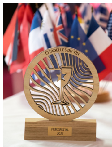
Trophy Citadelles du Vin