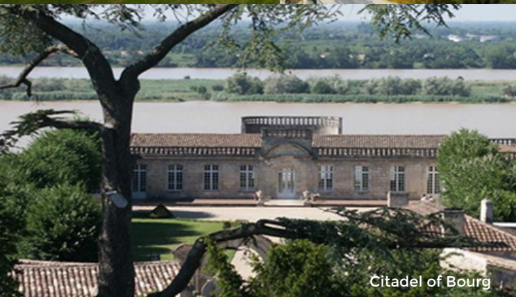
Citadel of Bourg