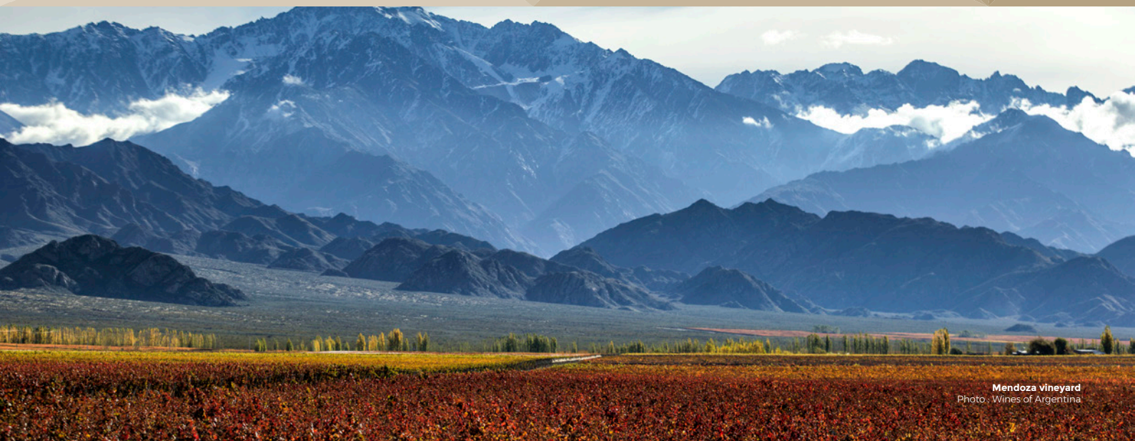
Mendoza vineyard