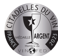
Adhesive medals recognized all over the world