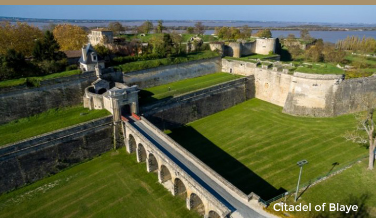
Citadel of Blaye

Strikingly majestic, the citadels of Blaye and Bourg – to which the competition owes its name – watch over the waters of the Gironde Estuary and overlook the surrounding vineyards. Like these sentinel buildings, the Citadelles du Vin competition does everything in its power to fulfil its mission as a bastion of excellence every year.