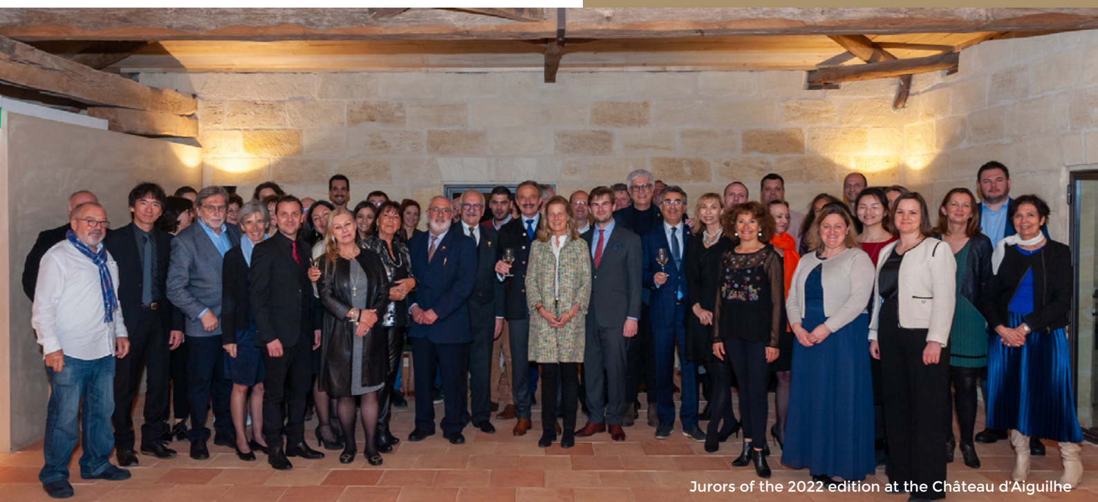
Jurors of the 2022 edition at the Château d'Aiguilhe