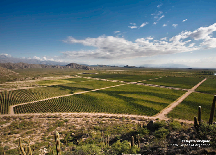
Cafayate vineyard