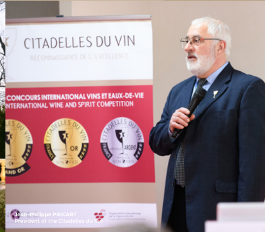
Citadelles du Vin 2023