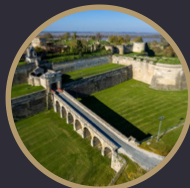
Citadel of Blaye