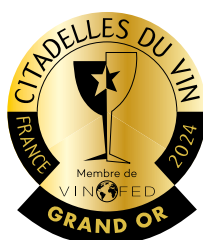
Adhesive medals recognized worldwide