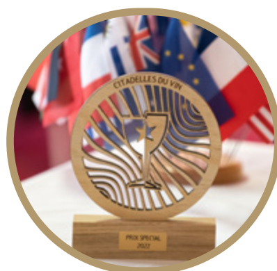
Citadelles du Vin Special Prize Trophy