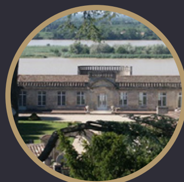
Citadel of Bourg

Strikingly majestic, the citadels of Blaye and Bourg - to which the competition owes its name - watch over the waters of the Gironde Estuary and overlook the surrounding vineyards. Like these sentinel buildings, the Citadelles du Vin competition does everything in its power to fulfil its mission as a bastion of excellence every year.